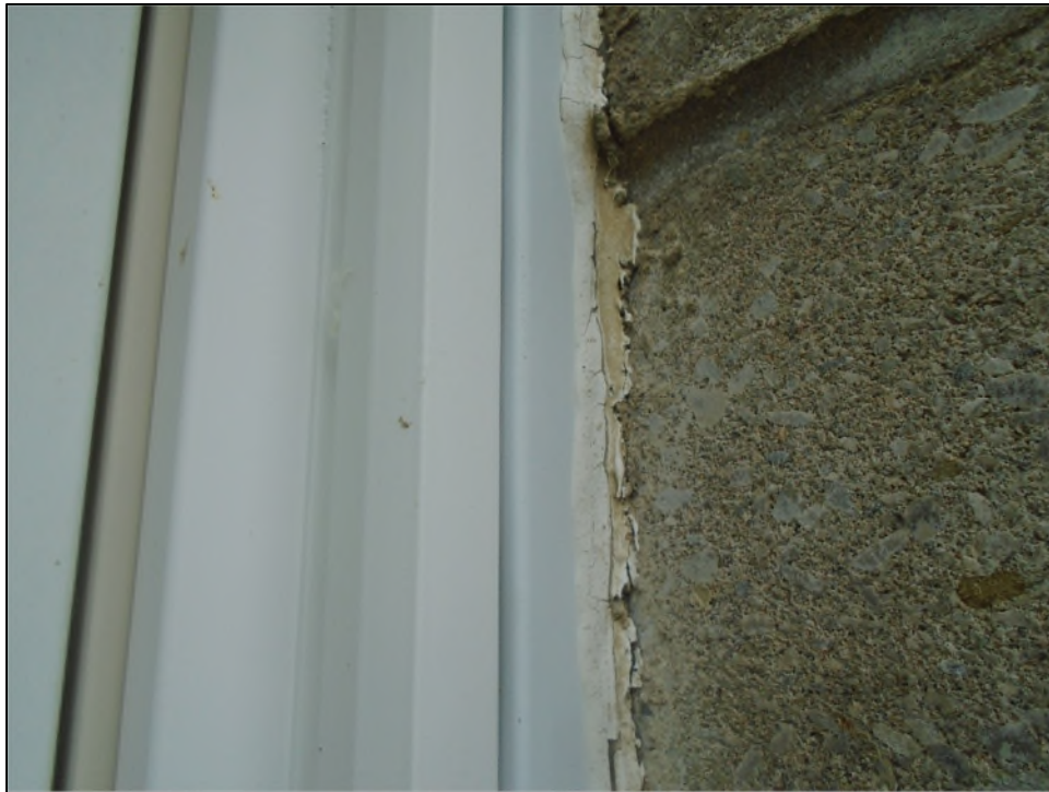
Photograph 1: View of asbestos-containing grey window, door and vent caulking on the exterior of Control Building A, assigned a Priority 2 .